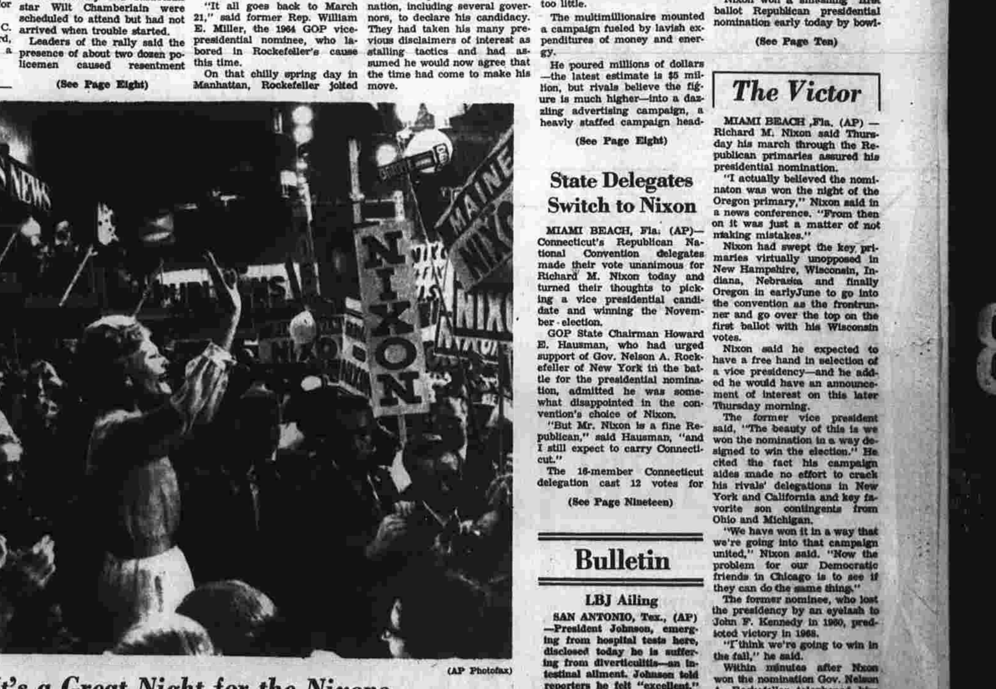
It's a Great Night for the Nixons Pat Nixon waves to delegates demonstrating for her husband, Richard M. Nixon after he was nominated to be the Republican presidential candidate at the GOP National Convention in Miami Beach early today. Lower left is David Eisenhower, engaged to one of the Nixons' daughter, Julia.

MIAMI BEACH, Fla. (AP)—Richard M. Nixon, winner of the Republican presidential nomination, today picked Gov. Spiro T. Agnew of Maryland as his running mate. Nixon made the announcement in a brief news conference at 12:40 p.m. He said some 100 party leaders had been consulted. The selection of Agnew, a one-time supporter of Gov. Nelson A. Rockefeller of New York, was a major surprise. The Maryland governor delivered the nomination speech for Nixon last night. Nixon opened his news conference saying the deliberations "have been very thorough on what we think is a tremendously important decision."