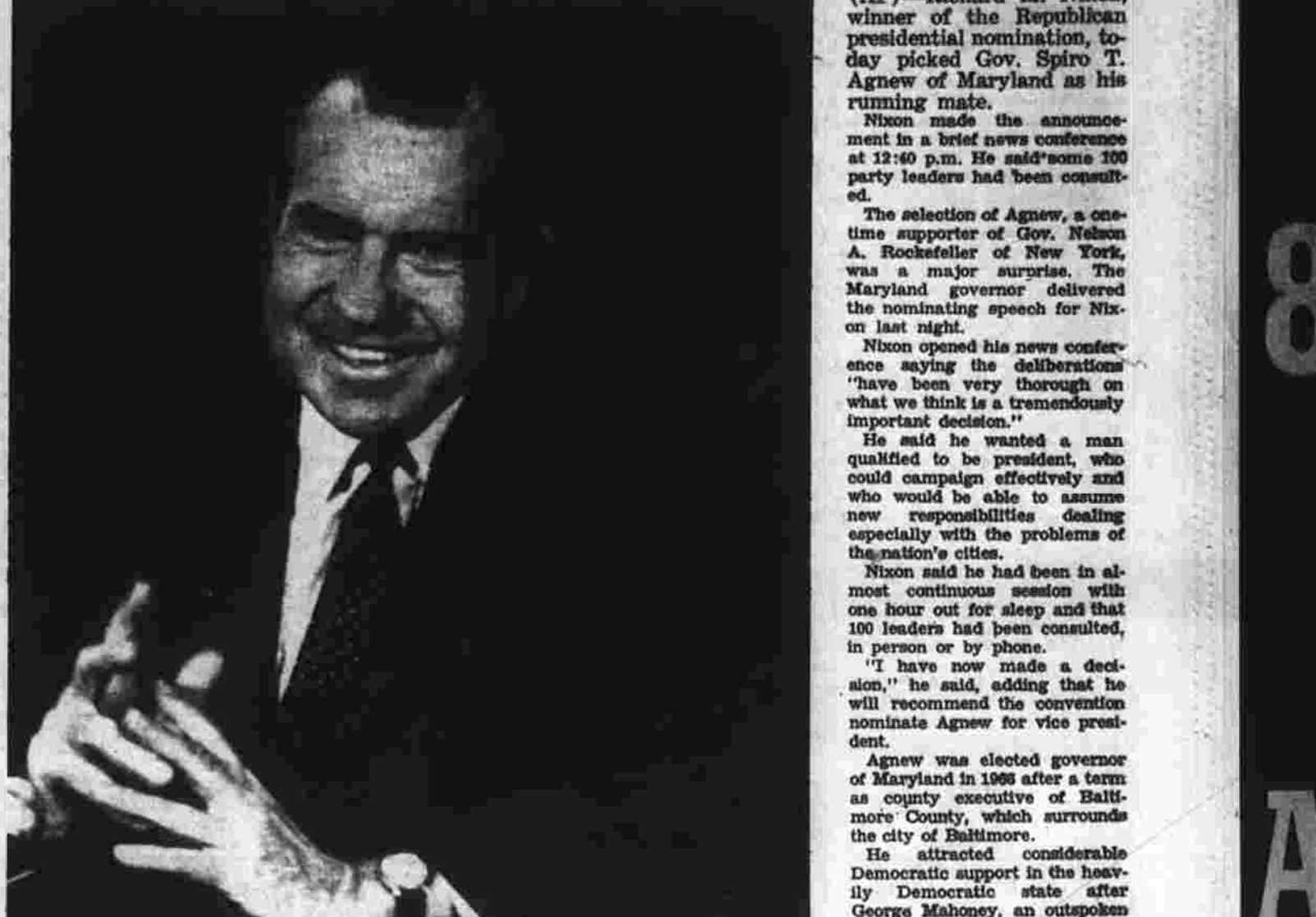
Richard M. Nixon Race Entered Too Late Rocky, Hesitates, Loses

MIAMI, Fla. (AP)—Bunches of young Negroes set fire to cars, stoned white motorists and looted stores in a five-block area of downtown Miami Wednesday night in a disturbance touched off when police arrested a male youth aimed at stirring problems facing Negroes. About 100 Negroes were arrested, mostly on charges of riotously looting and disturbing the peace. Trouble broke out in the predominantly Negro area about 8:30 p.m., several hours before Republican delegates to Miami Beach nominated Richard M. Nixon as their presidential candidate.